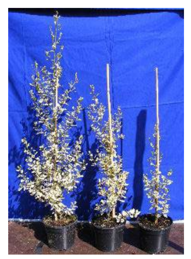
Figure 8. The marked variation present in experimental Rhamnus alaternus 'Argenteovariegata' finished plants. These were all grown from heel side-shoots, which show clearly the considerable variation present within cutting type for this species. They were graded as a First (LHS), First (Centre) and Second (RHS), respectively, at the end of the liner stage. They were then classified as saleable, saleable later and non-saleable (waste) respectively, for the 2008 sale period at the finished-plant producer's nursery.

As is the case for the other experimental species, the most probable explanation for the lack of any reliable relationship between the liner grade at NPN, Sidlesham and the subsequent 'saleability' of plants at HN, Romsey, is the subjectivity of the plant-grading procedures.