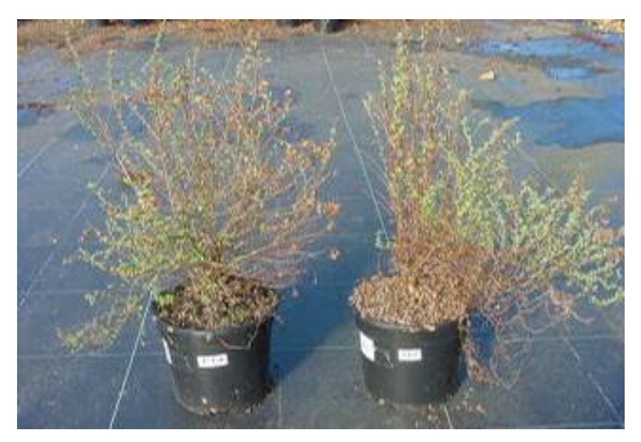
Figure 6. Examples of the variation present in experimental Potentilla 'Chelsea Star' finished plants. They were classified as a First (LHS) and a Second (RHS) as liners and as saleable (LHS) and saleable later (RHS) respectively, for the 2008 sale period at the finished-plant producer's nursery. The non-symmetrical shape of the plant on the RHS was present as a liner and is still clearly present in the finished plant.

This species of plant is traditionally seen as not presenting a non-uniformity problem and most plants grown at the finished-plant nursery eventually get sold. However, there were clear differences visible in the experimental plants (Figure 6) and six out of 17 First grade liners were not yet saleable at the due date. This would increase the costs of producing this species for the finished-plant producer.