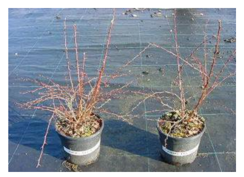
Figure 1. An example of the variation in bushiness present in experimental Berberis thunbergii 'Harlequin' finished plants. The LHS and RHS plants were grown from a 'Field-Best' and 'Container-Poor' cutting types, respectively. At the liner grading, the LHS plant was graded a First and the RHS plant a Second. They were then both classified as saleable (on 26/02/08), for the 2008 sale period, at the finished-plant producer's nursery.

Historical data from HN, Romsey on Berberis thunbergii 'Harlequin' at the end of the season show relatively little waste due to unsold plants. A possible explanation for this is that greater variation in plant batches may be acceptable for this species as this species is classed as a two-year crop by HN, Romsey.