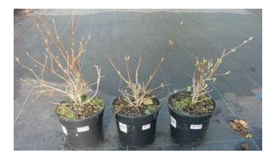
Figure 10. Examples of the variation in experimental finished Weigela 'Kosteriana Variegata' plants, which were graded as First (LHS), First (Middle) and Second (RHS) class liners, respectively. They were then classified as saleable, saleable later and never saleable for the 2008 sale period at the finished-plant producer's nursery. The