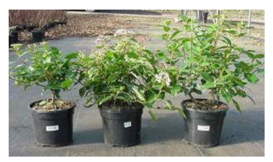
Figure 9. Examples of the variation in experimental finished Viburnum tinus 'Eve Price' plants, which were grown from a hard-2-internode (LHS), a single-1-internode (Middle) and a single-1-internode (RHS) cutting type and graded as First, Second and Second class liners, respectively. The 'Y'-shaped architecture of the lower stem in the Middle and RHS plants were still present and is clearly visible in the RHS plant. These plants were then classified as saleable, saleable later and never saleable for the 2008 sale period at the finished-plant producer's nursery.

As for the other experimental species, the most probable explanation for the lack of any reliable relationship between the liner grade at NPN, Sidlesham and the subsequent 'saleability' of plants at HN, Romsey is the subjectivity of the plant-grading procedures i.e. the similar numbers of Firsts and Seconds in each sale category is what one would expect if the liner quality categorization was being assigned randomly.