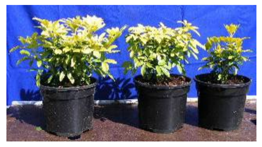
Figure 3. The variation in experimental finished Choisya ternata 'Sundance' plants, which were grown from a planted-2-leaf cutting (LHS), a potted-4-leaf cutting (Middle) and a planted-4-leaf cutting (RHS), which were graded as First, Second and Second class liners, respectively. They were then classified as saleable (LHS), saleable later (Middle) and never saleable (RHS) for the 2008 sale period at the finished-plant producer's nursery.

On 26/02/08, staff at HN, Romsey graded the plants into three categories: those that were saleable immediately; those that were considered to have the potential to become saleable at a later date; and those that would never become saleable (Figure 3). All four of the cutting types produced approximately the same number of saleable plants. This result can be explained by the HN liner grading specification, which was "10 cm tall, 5 breaks" and did not specify where the breaks must appear. Plants with quite different 'architecture' were acceptable for sale from the finished-plant nursery. Finished plants grown from 'planted' cuttings produced the highest numbers that would never become saleable, although this conclusion cannot be tested statistically due to the small numbers of plants present in each category (Table 5).