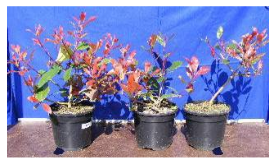
Figure 5. The marked variation present in experimental Photinia x fraseri 'Red Robin' finished plants. These were grown from a stem tip (LHS), a stem middle (Centre) and a stem bottom (RHS) cutting type and graded as a liner First, Second and Second, respectively, at the end of the liner stage. They were then classified as saleable, saleable later and non-saleable (waste) respectively, for the 2008 sale period at the finished-plant producer's nursery.

No clear relationship could be found, however, between the type of cutting that the plant originated from and the subjective assessment of whether or not it was saleable now, later or never. Twenty-one out of 71 remaining plants (35.2%) were effectively classed as 'never saleable', i.e. waste (Table 9).