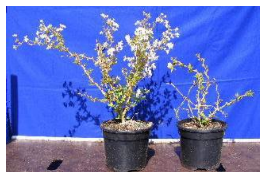
Figure 7. Examples of the variation present in experimental Prunus incisa 'Kojo-nomai' finished plants. These were grown from a side-shoot cutting (LHS) and a mainstem tip cutting (RHS) and graded as a liner First (LHS) and Second (RHS) respectively, at the end of the liner stage. They were then classified as saleable (LHS) and non-saleable (RHS) respectively, for the 2008 sale period at the finished-plant producer's nursery.

As mentioned at the beginning of this section on Prunus incisa 'Kojo-no-mai', the liner grading process was very subjective and a more quantitative approach would have greatly improved the fit between the liner and finished-plant grades. The historical losses due to non-uniformity at the finished plant nursery for this species can be as high as 13%. This figure could be reduced by greater objectivity and quantification in the grading process.