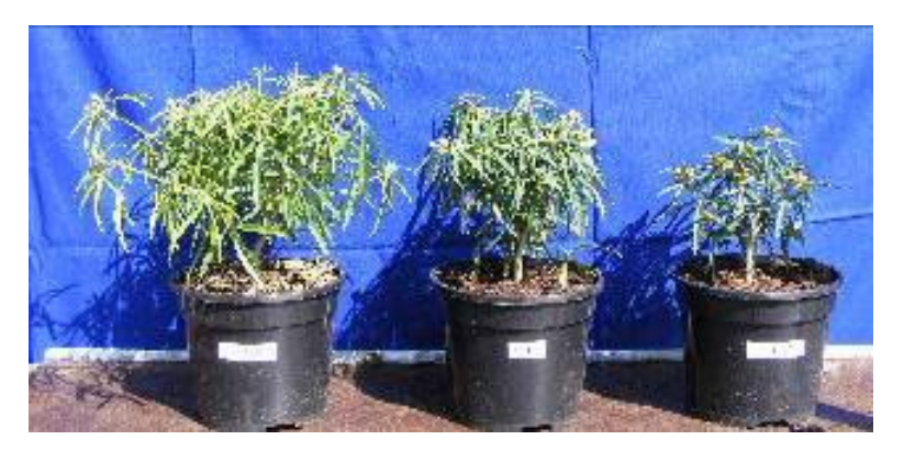
Figure 2. The variation in experimental finished Choisya 'Aztec Pearl' plants, which were grown from a single-node cutting with two leaves (LHS), a standard two-node cutting (Middle) and a tip cutting (RHS) and graded as First, First and Second class liners, respectively. The 'Y'-shaped architecture of the lower stem in the LHS plant is still clearly present. These plants were classified as saleable (LHS), saleable later (Middle) and never saleable (RHS) for the 2008 sale period at the finished-plant producer's nursery.

All three of the cutting types produced approximately the same number of saleable plants. This result can be explained by the HN liner grading specification, which was '10 cm tall, 5 breaks', which did not specify where the breaks must appear. Individual plants of this species, which had very different 'architectures', were apparently acceptable for sale when present in the same batch, i.e. uniformity was not apparent in the batch of saleable plants.